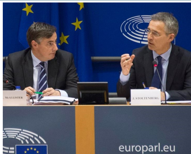
NATO Secretary General Jens Stoltenberg briefing the European Parliament on NATO-EU cooperation on 3 May in Brussels, next to European Parliament Foreign Affairs Committee Chair David McAllister.

On 15 and 16 February, NATO Defence Ministers decided to strengthen NATO's presence in the Black Sea region, approved a Cyber Defence plan and decided to create a military hub at NATO's Joint Force Command in Naples to gather intelligence and situational awareness in the Mediterranean region. NATO also received a request from Libya's Government of National Accord for NATO advice and expertise in defence and security institution building.