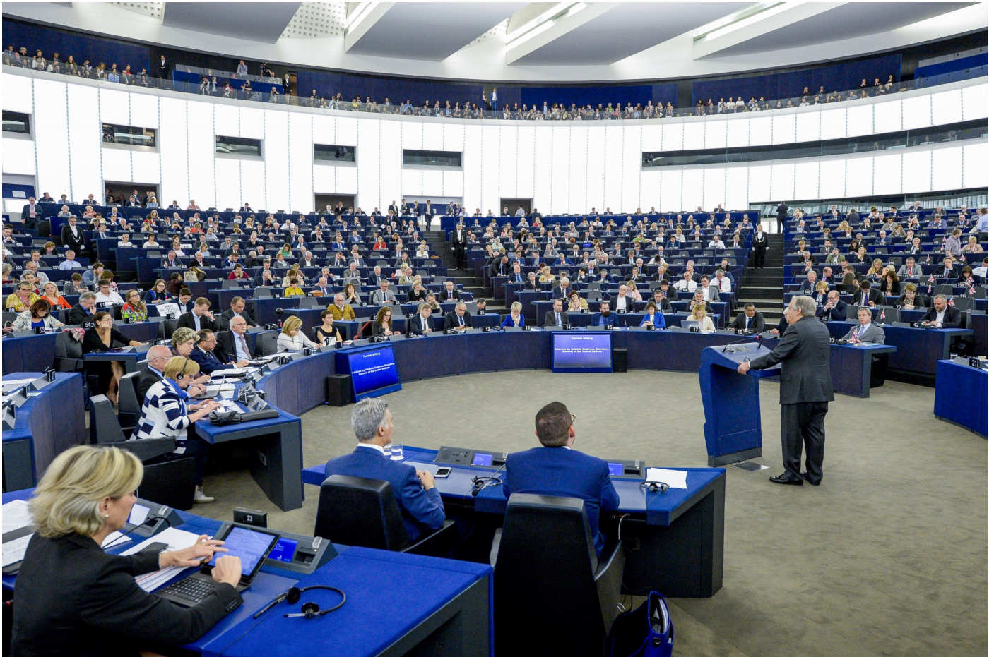
Secretary-General António Guterres addresses the European Parliament in Strasbourg, on 17 May 2017.

With a view to strengthen the UN-EU partnership, the United Nations Secretary-General, António Guterres, touched down in Strasbourg on 17 May to address the Plenary of the European Parliament for the first time since taking office. He expressed his strong support for the European Union, calling it the “most successful project of peace sustainability” and underlining that a “strong and united Europe is an absolutely fundamental pillar of a strong and effective United Nations”. He thanked the EU for its commitment to multilateralism and its generous contribution to development, humanitarian efforts and to the core of UN action, namely peace and security. He mentioned the EU’s work in Libya, the