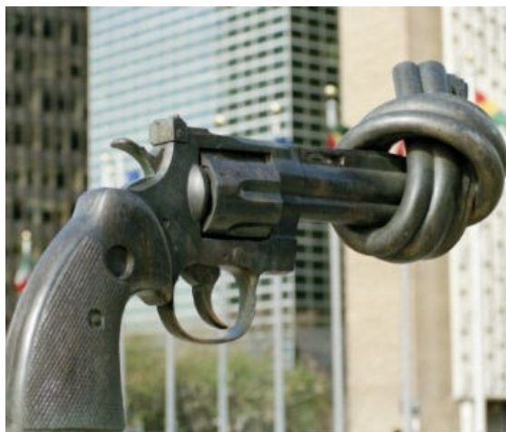
The Non-Violence sculpture at the UN Visitors Entrance in New York.

The UN and the EU examined fundamental elements of sustaining peace and assessed conflict prevention tools during the third annual UN-EU Conflict Prevention Dialogue on 23 March in Brussels. Discussions focused on enabling environments for conflict prevention, resilience and working in an integrated manner in view of the EU integrated approach and the Joint UNDP-DPA Programme on Building National Capacities for Conflict Prevention.