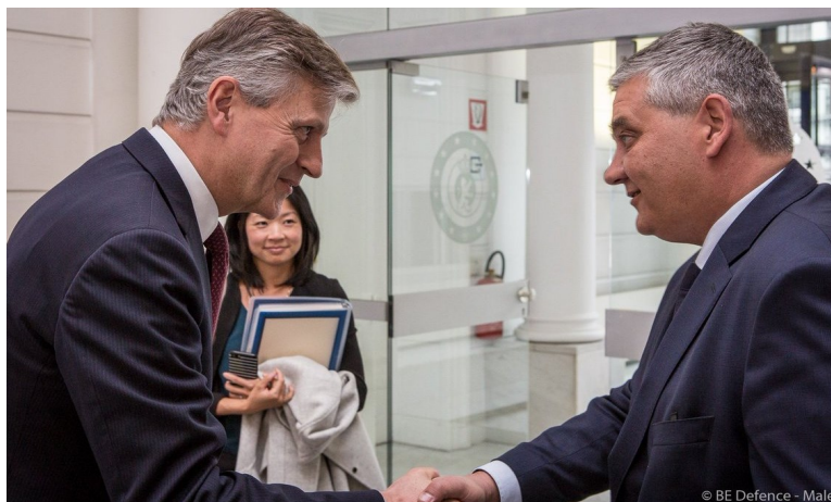
USG Jean-Pierre Lacroix and Belgian Defence Minister Steven Vandeput in Brussels on 5 May 2017.