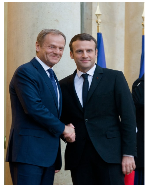
French President Emmanuel Macron and European Council President Donald Tusk in Paris, on 17 May.

The EU held a donor conference on Syria on 5 April, attended by the UN Secretary-General, mobilizing over six billion euros in pledges for the country in 2017. Previously, a donor conference on the Central African Republic on 17 November saw pledges of more than two billion euros. The new 95 million euros EU Trust Fund for Colombia was launched in December.