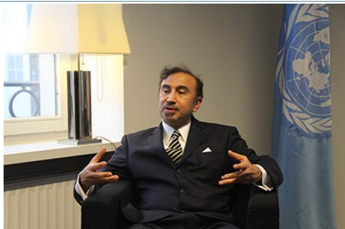
Director of the UN Counter-Terrorism Implementation Task Force and the Counter-Terrorism Centre, Jehangir Khan, interviewed on the margins of the UN-EU Political Dialogue on Counter-Terrorism.

Prevention of violent extremism has significantly risen on the agendas of both organizations and counter-terrorism has gained a more prominent place in the institutional setup, with the recent establishment of an EU Commissioner for Security Union and a proposal before the General Assembly to create a new office for counter-terrorism in the UN.