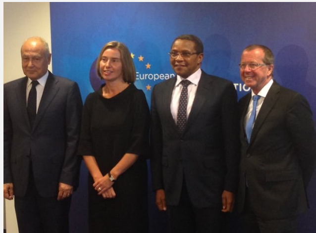
From left to right: Secretary General of the League of Arab States Ahmed Abo El-Gheit, HR/VP Federica Mogherini, High Level Representative of the African Union to Libya Jakaya Kikwete, and SRSG and Head of UNSMIL Martin Kobler, at the Libya Quartet meeting in Brussels on 23 May 2017.