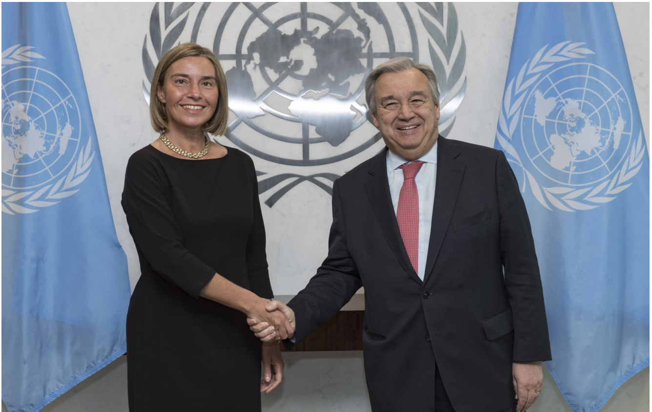
High Representative of the European Union for Foreign Affairs and Security Policy and Vice-President of the European Commission (HR/VP) Federica Mogherini and UN Secretary-General António Guterres in the UN Headquarters, New York, on 9 May 2017.

EU funding for AMISOM in Somalia, and the EU's financial support and training & capacity building in the Central African Republic and Mali (adding that he was looking forward to the contribution for the G5 Sahel Joint Task Force). He stressed the importance of UN-EU cooperation in working together to meet the unprecedented challenges facing the international community, primarily the multiplication of conflicts that are more protracted and increasingly linked to regional and global issues, including terrorism. The Secretary-General received a standing ovation from the Members of the European Parliament and European Parliament President Tajani assured the EU's continued commitment to the partnership.