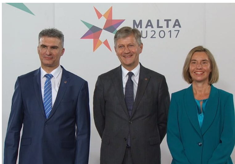
From left to right: Former Maltese Home Affairs and National Security Minister Carmelo Abela, USG for Peacekeeping Operations Jean-Pierre Lacroix and HR/VP Federica Mogherini at the Informal meeting of EU Defence Ministers in Valletta, Malta, on 26 April 2017.

It is expected that European Defence Ministers, alongside senior EU and NATO officials, will participate in the 2017 UN Peacekeeping Defence Ministerial which take place in Vancouver, Canada on 14-15 November. The Ministerial builds on the 2015 Leaders' Summit on peacekeeping and the 2016 London Ministerial on peacekeeping where European countries, the EU and NATO actively participated and put forward pledges. Both the EU and NATO will also participate in the upcoming UN Chiefs of Defence (CHODs) Conference on 6 and 7 July at UN Headquarters in New York, which builds on the first such UN CHODs conference held in 2015.