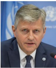
Under-Secretary-General Jean-Pierre Lacroix is the head of DPO.

The Department of Peace Operations (DPO) is dedicated to assisting the Member States and the Secretary-General in their efforts to maintain international peace and security. DPO provides political and executive direction to UN peace operations around the world and maintains contact with the Security Council, troop and financial contributors, and parties to the conflict in the implementation of Security Council mandates.