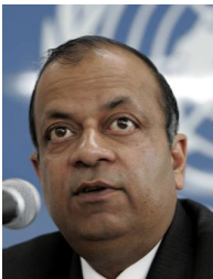
Under-Secretary-General Atul Khare is the head of DFS.

The Department provides direction to UN peacekeeping operations around the world and maintains contact with the Security Council, troop and financial contributors, and parties to the conflict in the implementation of Security Council mandates.