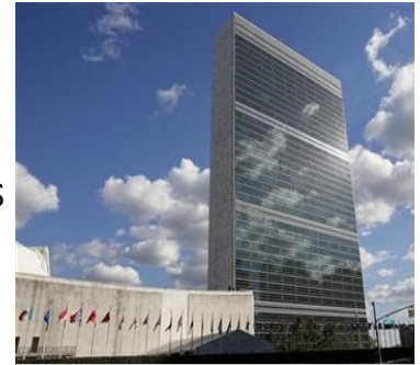
The United Nations Headquarters in New York.

UNLOPS was established in Brussels in 2011 to develop closer, more predictable and continuous partnerships between the UN and the European Union (EU), the North Atlantic Treaty Organization (NATO) and other Brussels-based organizations. UNLOPS supports institutional dialogue and improved coordination on peace and security policy, operations and programmes with a view to preventing violent conflict, managing crisis and countering terrorism. The office facilitates high level UN visits from New York and the field to Brussels, supports UN-EU and UN-NATO information exchange, and backstops the UN-EU Steering Committee on Crisis Management, the UN-EU Partnerships Meeting on Conflict Prevention, the UN-EU Leadership Dialogue on Counter-Terrorism, and the UN-NATO Staff Talks.