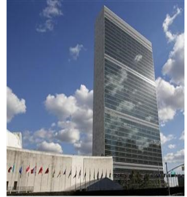
The United Nations Headquarters in New York.

UNLOPS was established in 2011 to support institutional dialogue and improved coordination on peace and security policy, operations and programmes with a view to preventing violent conflict, managing crises and countering terrorism. The office facilitates high level UN visits from New York and the field to Brussels, supports UN-EU and UN-NATO information exchange and backstops the UN-EU Steering Committee on Crisis Management, the UN-EU Conflict Prevention Dialogue, the UN-EU Leaders' Dialogue on Counter-Terrorism, and the UN-NATO Staff Talks.