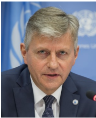
Under-Secretary-General Jean-Pierre Lacroix is the head of DPO in New York.

The Department of Peace Operations (DPO) is dedicated to assisting the Member States and the Secretary-General in their efforts to maintain international peace and security. DPO provides political and executive direction to UN peace operations around the world and maintains contact with the Security Council, troop contributing countries, and parties to the conflict in the implementation of Security Council mandates.