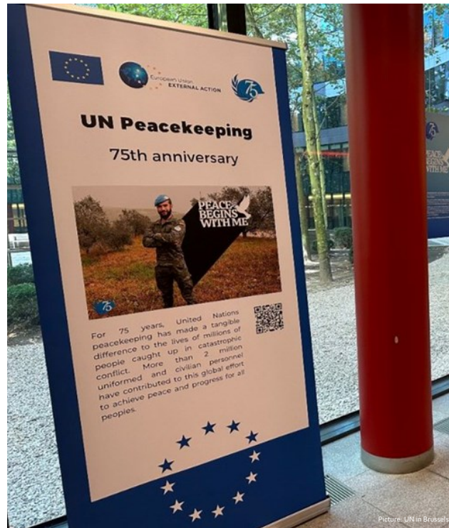
The "Peace begins with me" exhibition celebrating the 75 th anniversary of UN peacekeeping operations was displayed at EEAS headquarters in Brussels in September/October 2023.