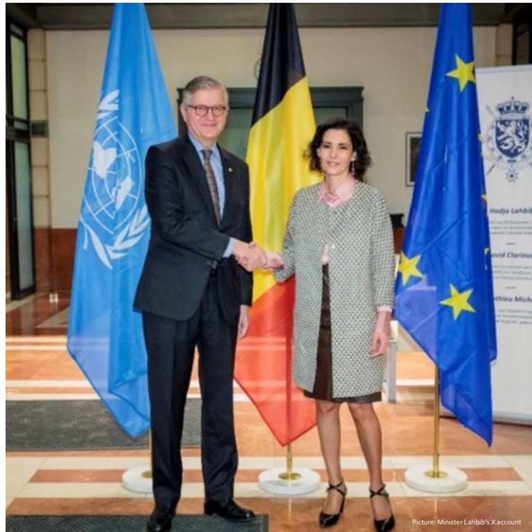
USG Jean-Pierre Lacroix and Belgian Minister for Foreign Affairs Hadja Lahbib in Brussels on 31 January 2024.

The Belgian Presidency: Belgium holds the presidency of the Council of the EU from 1 January to 30 June 2024. The program sets out six priorities including "protecting people and borders" and "promoting a global Europe". Belgium's thirteenth presidency also focuses on Foreign Affairs, especially peace, security, and defence matters. Belgium will ensure "unwavering political, economic, military, humanitarian and legal support to Ukraine". The country is also working on the shaping of the post-2024 Strategic Agenda. Additionally, the presidency will continue to support the EU Strategic Compass to strengthen EU's resilience to new and hybrid threats.