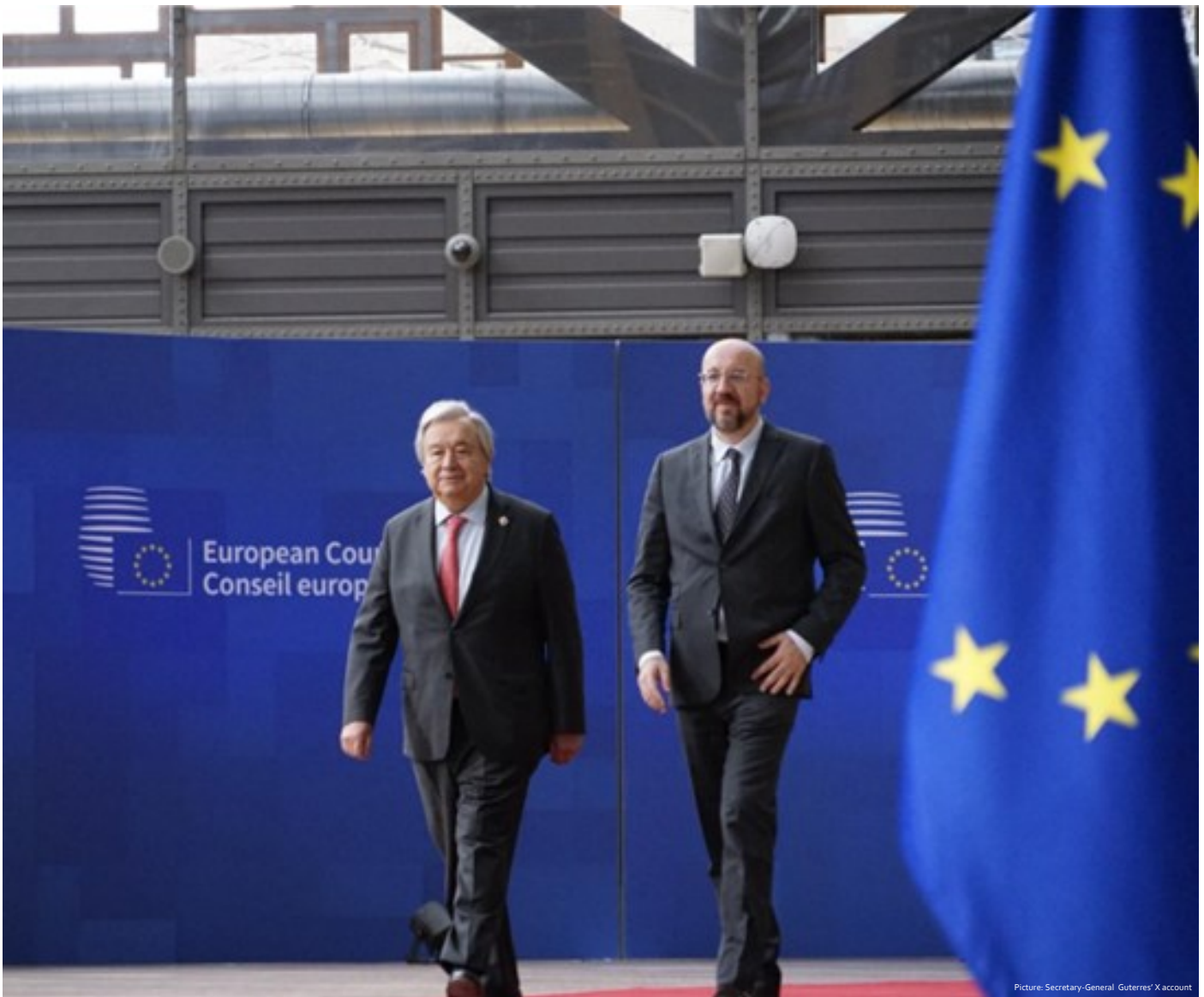
UN Secretary-General António Guterres and European Council President Charles Michel.

The Secretary-General stressed the need to stick to principles, without double standards, pointing to the UN Charter, international law, territorial integrity, and international humanitarian law. The Secretary-General appealed for peace in Ukraine respecting the charter, international law and its territorial integrity and sovereignty, and for a ceasefire in Gaza. The UN chief also stressed the need for strong multilateral institutions and for the EU to play an active role in relation to the existential questions that threaten today's world: climate change, the uncontrolled development of artificial intelligence and deep inequalities.