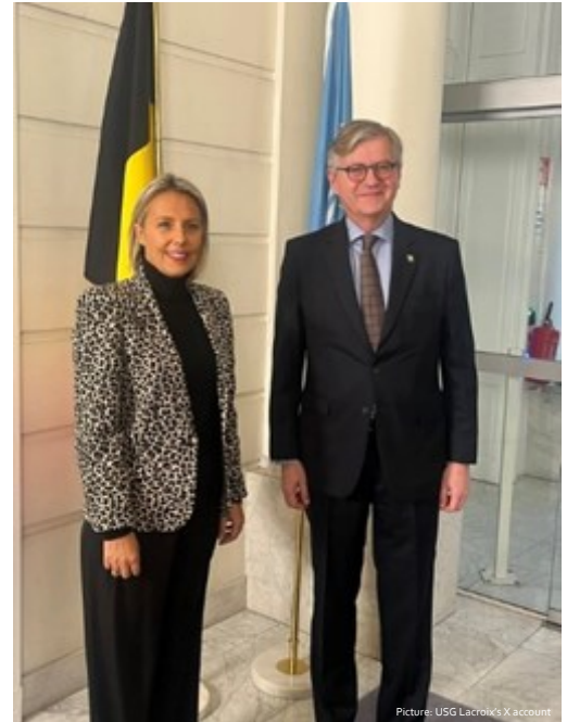
Belgian Minister of Defence Ludivin Dedonder and USG Jean-Pierre Lacroix met in the margins of an EU defence ministerial

On 15 December 2023, USG Lacroix participated in the UN-EU Steering Committee on crisis management and peace operations in Brussels, co-chaired by EEAS Deputy Secretary-General for peace, security and defence, Charles Fries. USG Lacroix and DSG Fries took stock of recent political and security developments in the Middle East and Africa and discussed the UN-EU partnership in the context of the Secretary-General's "A New Agenda for Peace" and the EU's strategic compass. On the margins, USG Lacroix engaged with several EU PSC ambassadors at a gathering kindly convened by Portugal.