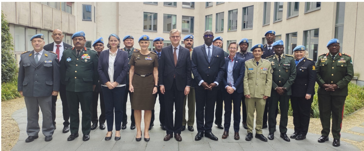
Participants of the 1st joint Heads of UN Military and Police Components Conference, 9 October, Ireland's Permanent Representation, Brussels