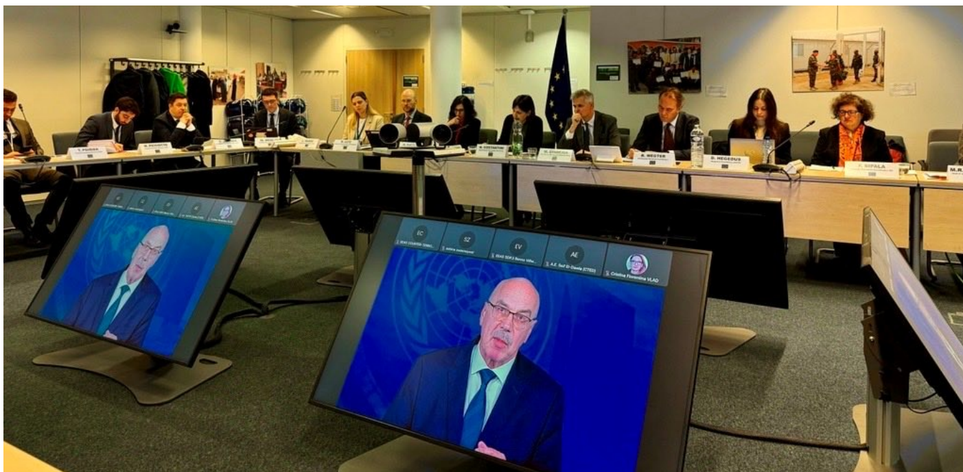
UN USG for Counter-Terrorism, Vladimir Voronkov