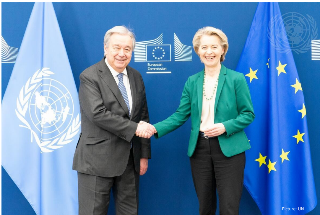
UN Secretary-General António Guterres and European Commission President Von der Leyen in Brussels on 20 March

UN Secretary-General António Guterres was invited to attend a working lunch with the heads of state and government of the 27 EU member states, at the European Council on 20 March. Speaking to the press, the Secretary-General expressed his appreciation for the UN's partnership with the European Union, reiterating that it is a fundamental pillar of the multilateral response to the challenges we face in peace and security, climate, sustainable development and human rights. The Secretary-General appealed for peace in Ukraine respecting the UN charter, international law, Security Council resolutions and its territorial integrity, as well as renewed his appeal for respect of the ceasefire in Gaza, for unimpeded humanitarian access to all areas of Gaza, and for the immediate and unconditional release of the hostages.