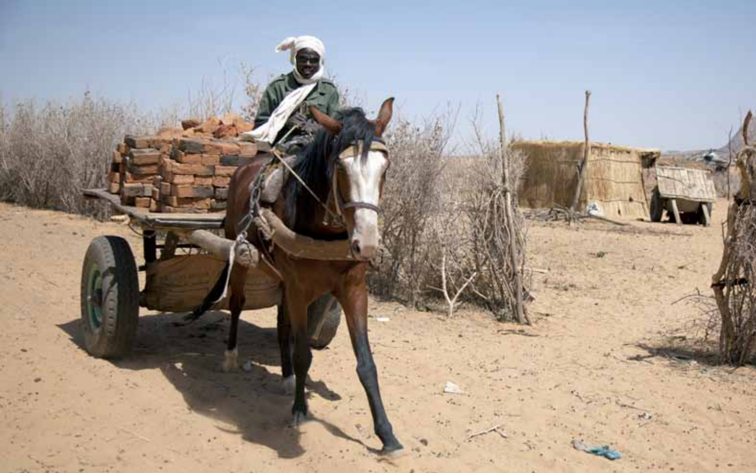
left. Children in Goz Mino village in West Darfur - one of the areas of returnee from Chad