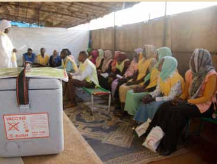
Health workers are briefed before embarking on the vaccination campaign