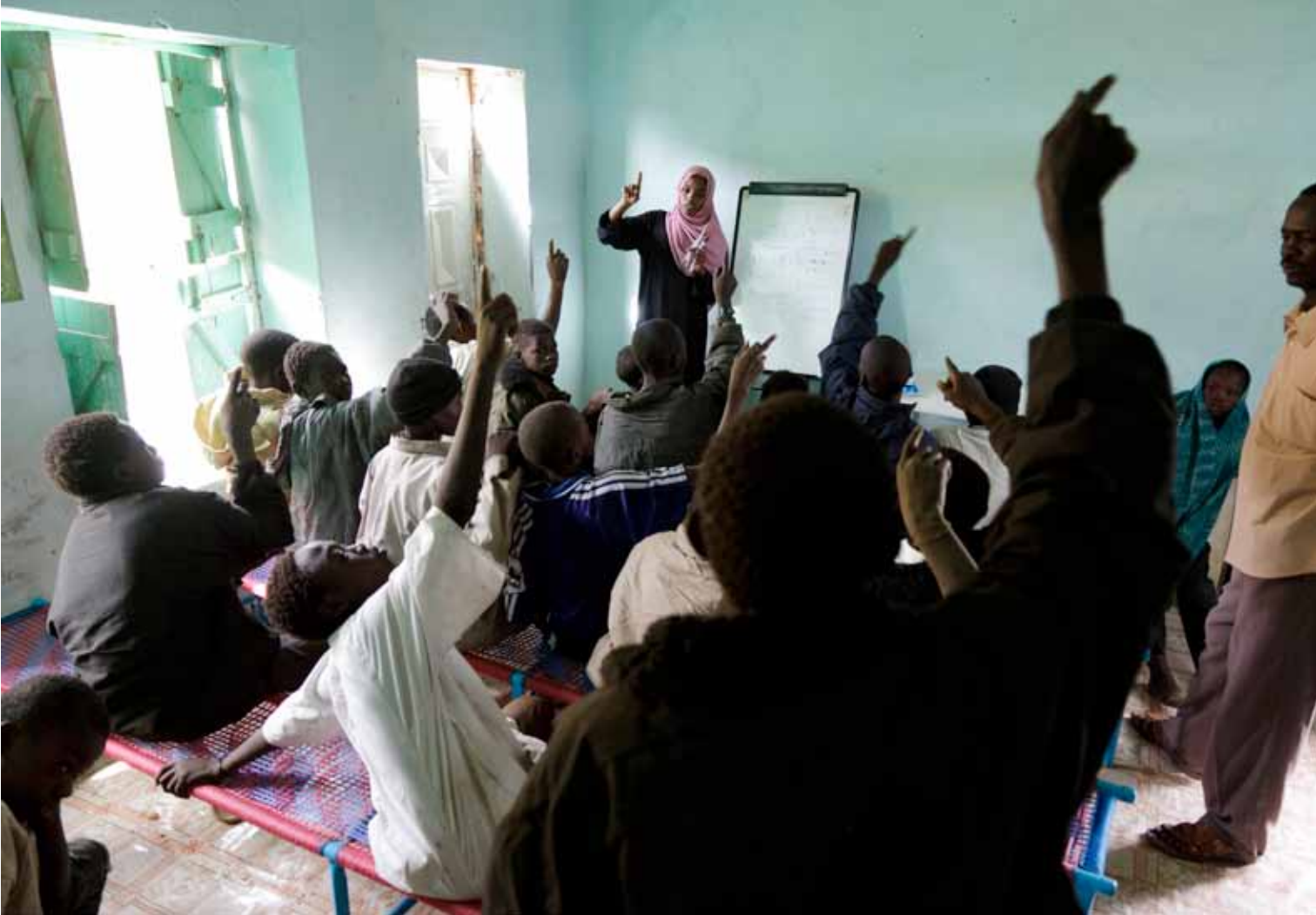
left. Street children enjoying the refuge of the centre