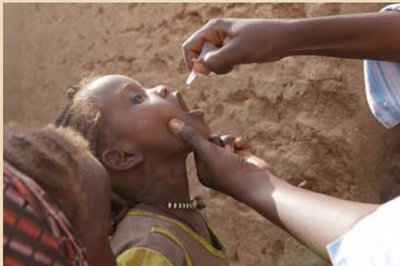
A child receives the polio vaccine in Abu Shouk camp