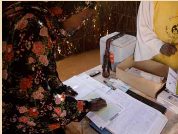
Registering each child's name after vaccination

Organization (WHO) and United Nations Children's Fund (UNICEF), thousands of teams were spread across Darfur states to administer the polio vaccine to all children under 5 years of age. It has now been extended to inaccessible regions, such as Jebel Marra in West Darfur, where polio is considered a high risk due to ongoing insecurity in these areas. To date, more than 400, 000 children living in Darfur have been given vaccines. In El Fasher, the team conducted door-to-door visits, in the towns, villages and IDP camps vaccinating the children living in each household. On the day before the campaign began, officials from the Health Ministry informed parents and guardians that all children younger than 5 years old must be vaccinated.