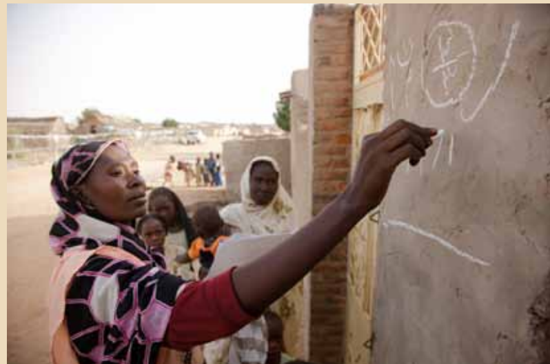
Volunteers in Abu Shouk camp place marks on the wall after administering polio vaccines to children