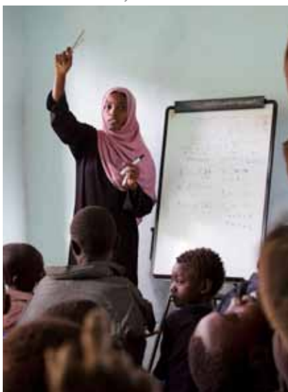
Returnee children in Sullu

Back Cover Photo by Albert Gonzalez Farran