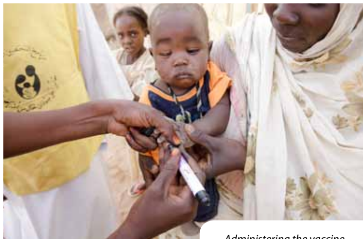
Administering the vaccine

Health officials also stress that giving the polio vaccine multiple times to a child can save his or her life.