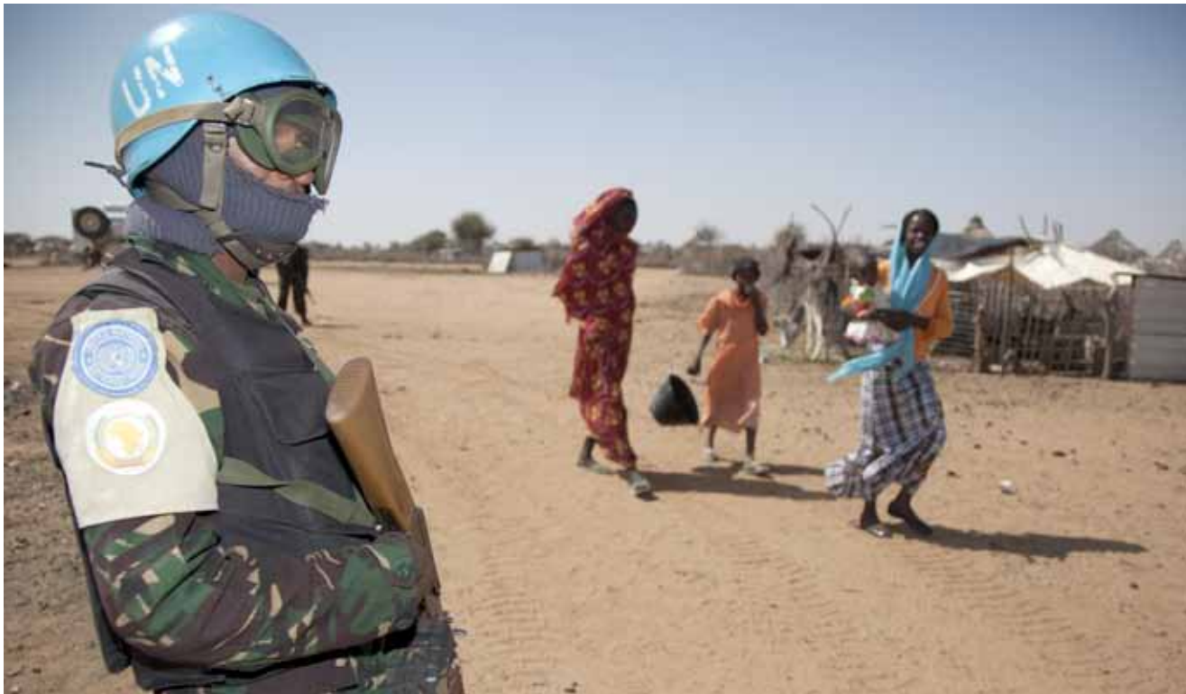
A UNAMID peacekeeper guards IDPs in Khor Abeche